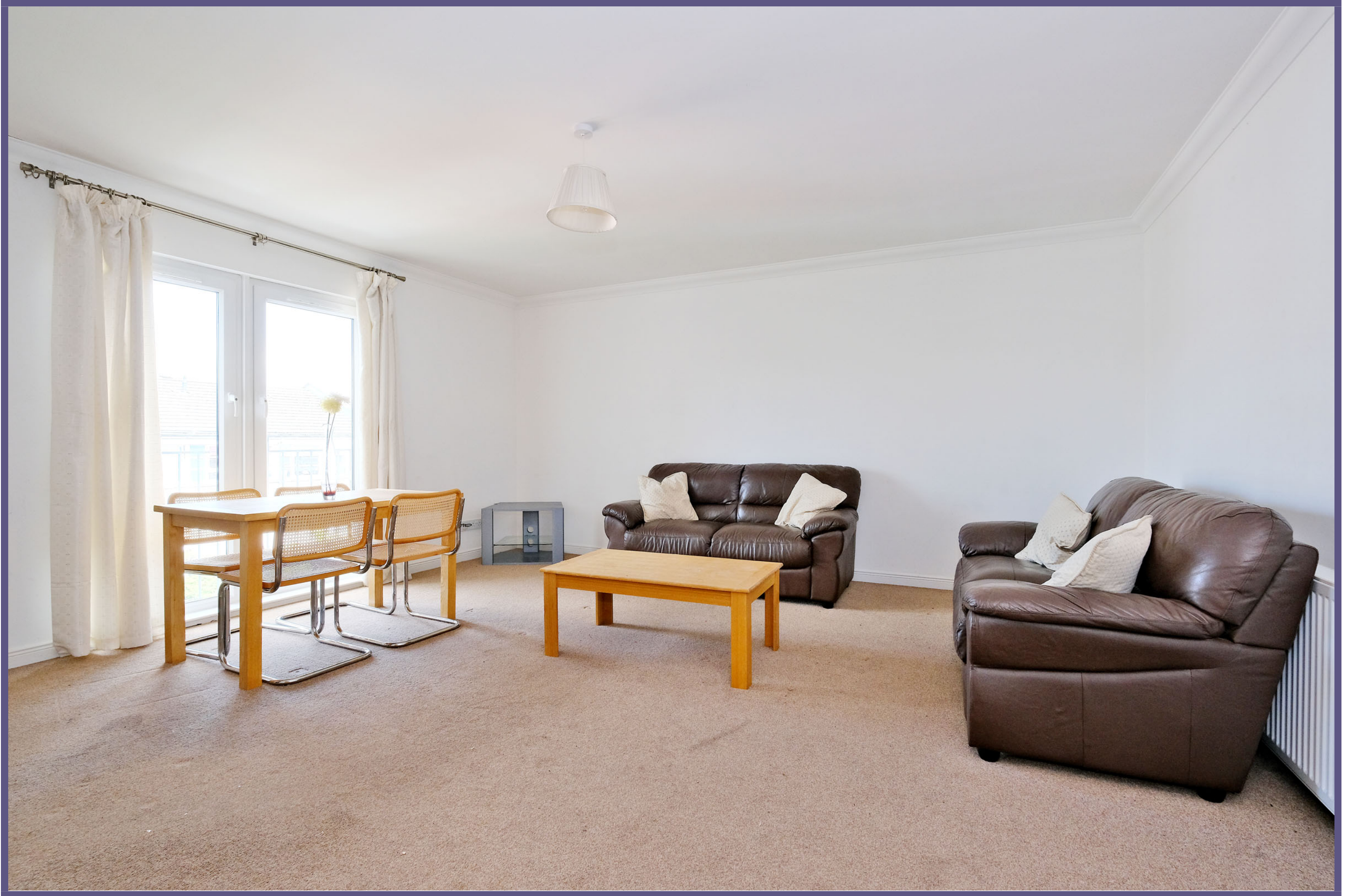
Lounge / Dining Room