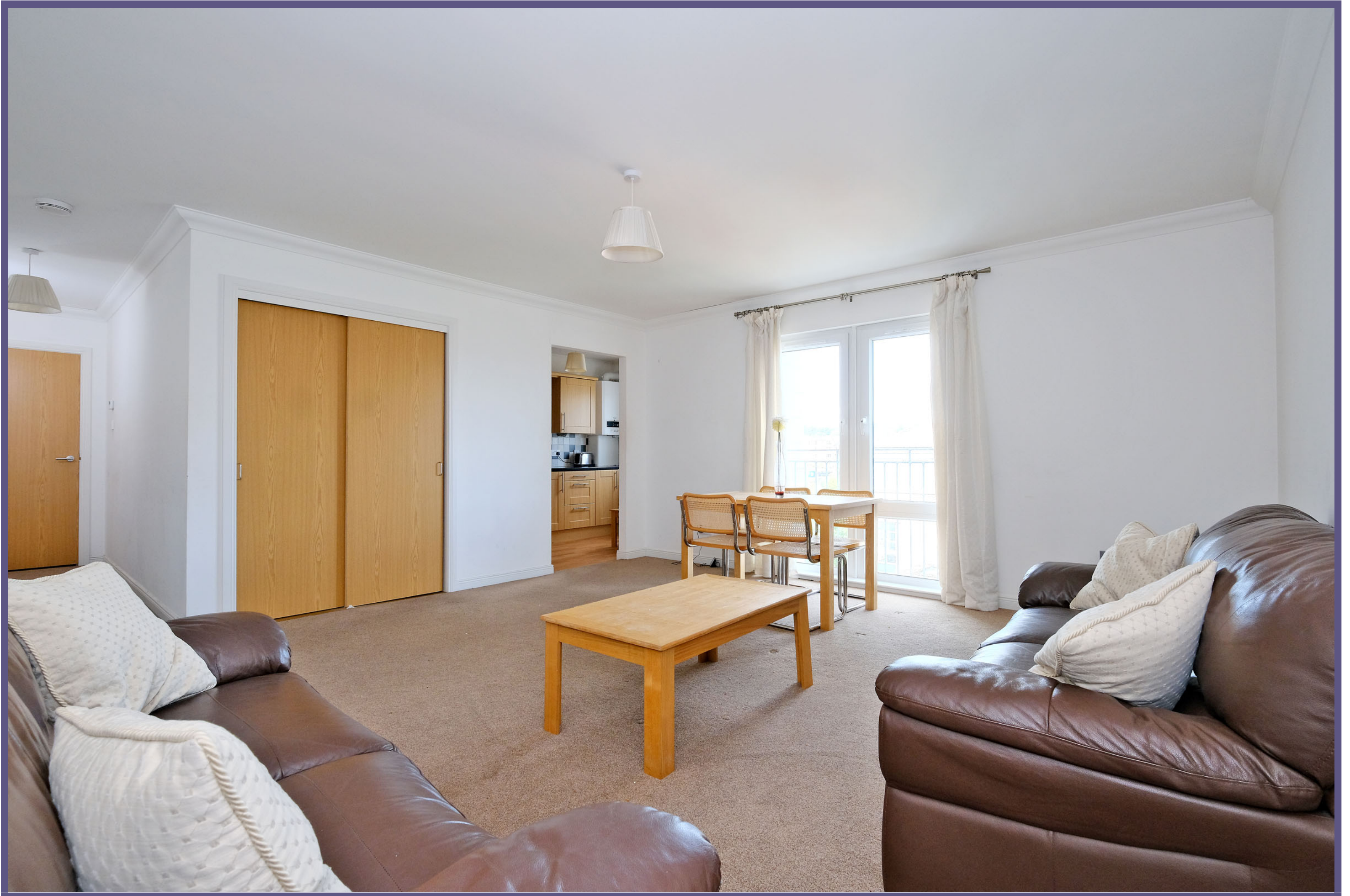
Lounge / Dining Room